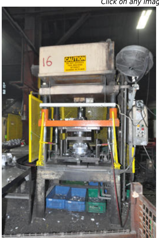
Click on any image for a larger view