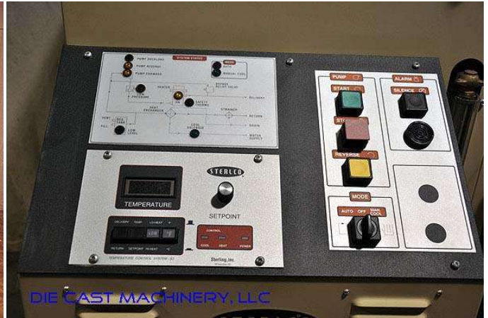
DIE CAST MACHINERY, LLC