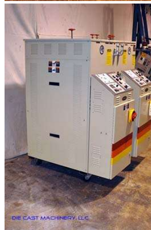
DIE CAST MACHINERY, LLC