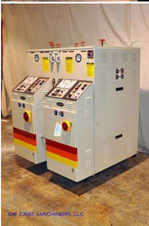
DIE CAST MACHINERY, LLC