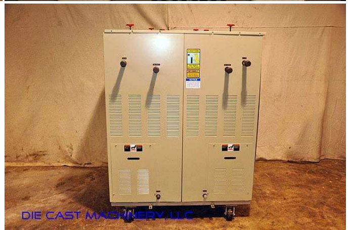
DIE CAST MACHINERY, LLC