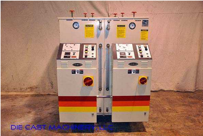
DIE CAST MACHINERY, LLC