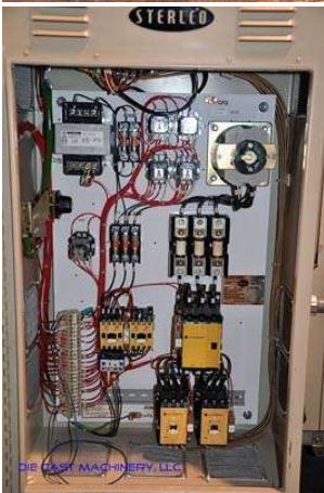
DIE CAST MACHINERY, LLC