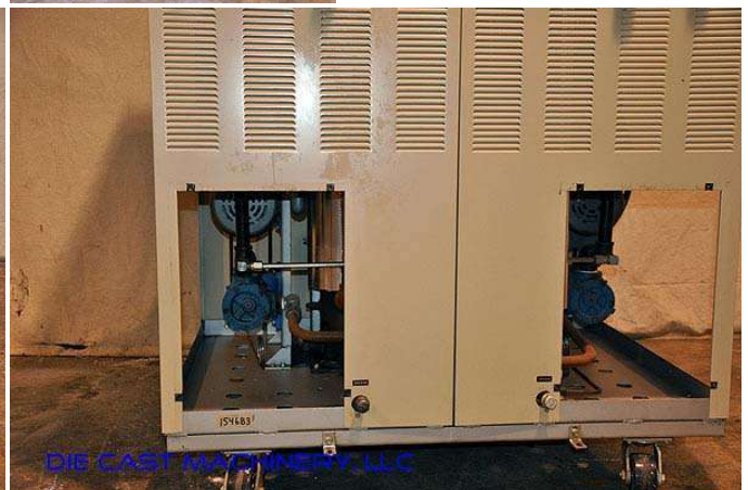
DIE CAST MACHINERY, LLC