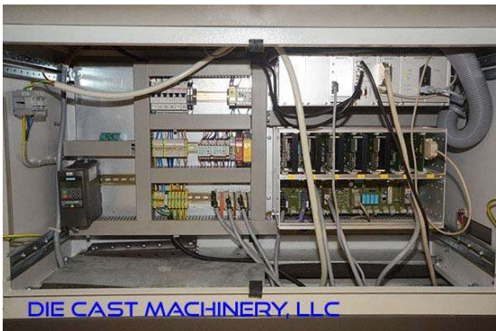
DIE CAST MACHINERY, LLC