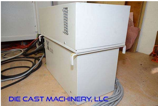
DIE CAST MACHINERY, LLC