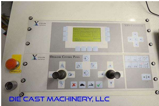
DIE CAST MACHINERY, LLC