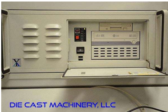
DIE CAST MACHINERY, LLC