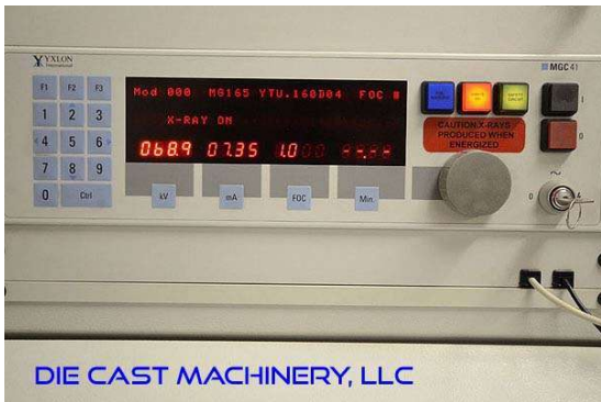
DIE CAST MACHINERY, LLC