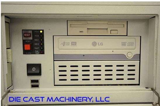
DIE CAST MACHINERY, LLC