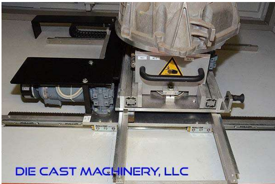
DIE CAST MACHINERY, LLC