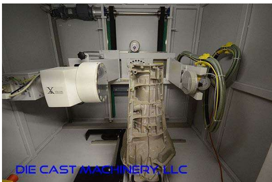
DIE CAST MACHINERY, LLC